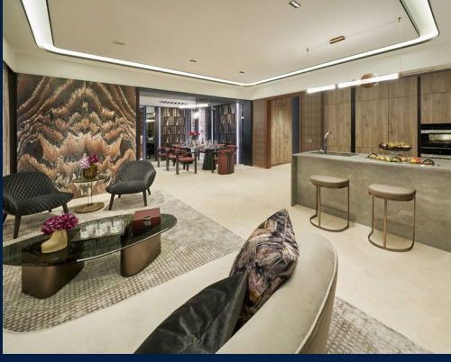
5 - Bedroom Premium