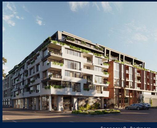
Spencer: 2 - Bedroom