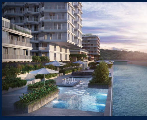
3 - Bedroom Premium