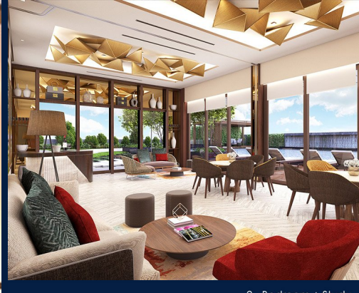
2 - Bedroom + Study