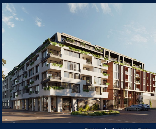
Stanley: 2 - Bedroom + Study